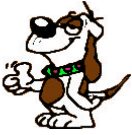
And your killer attorney (who is friends with everybody)

To keep order (and legal scholars from laughing out loud) we have: